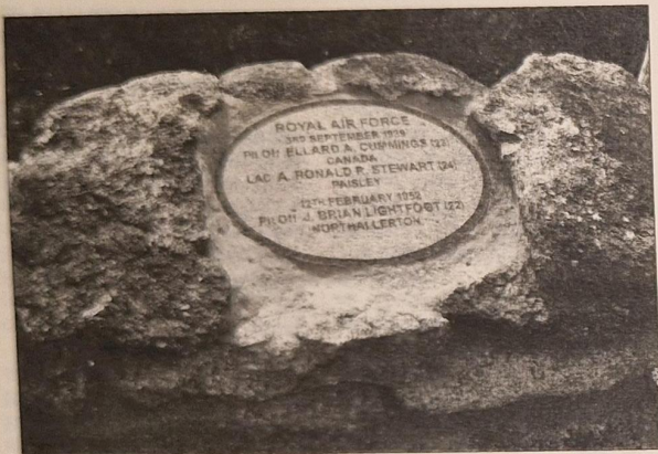
In tribute: The commemorative plaque made of pink granite on the cairn on Oxencraig.